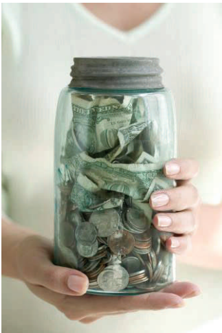
MKM Account 411