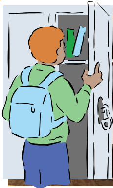
People collect things like Locker locks, Tissue box covers, Fish of the world posters, Covers, fortune cookies ....